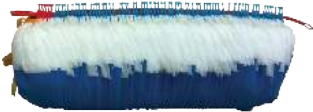
Bundle of Booties

Shoe Cover Refills for KineticButler Automatic Shoe Cover Dispensers