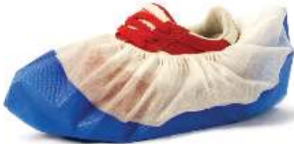
Shoe Cover Dimensions