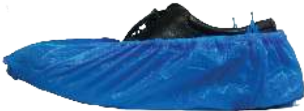
Shoe Cover Dimensions