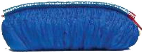
Bundle of Booties

Shoe Cover Refills for KineticButler Automatic Shoe Cover Dispensers